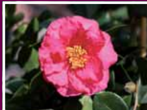
FEATURE – camellias