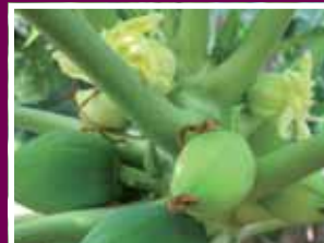
FRUIT & VEG – for small gardens