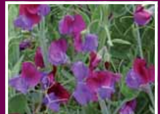
CALENDAR – May / June / July