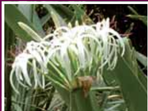
GARDENS – resilient plants