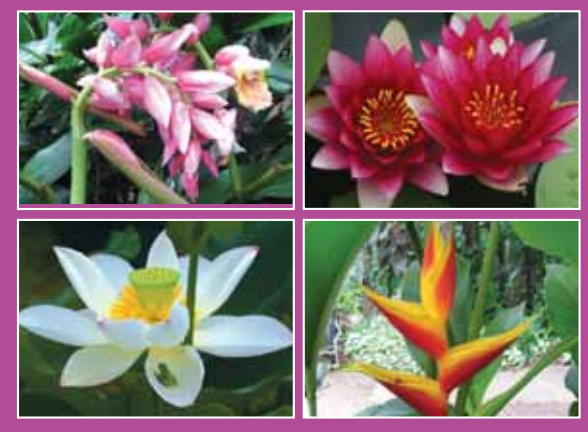
VISITS BY APPOINTMENT ONLY

We also specialise in: Gingers, Heliconias, and other Tropical and Subtropical plants.